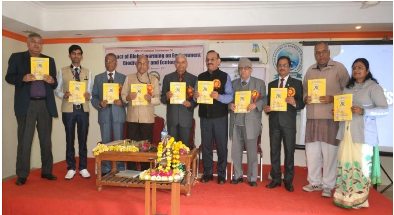
Released Souvenir by Guest