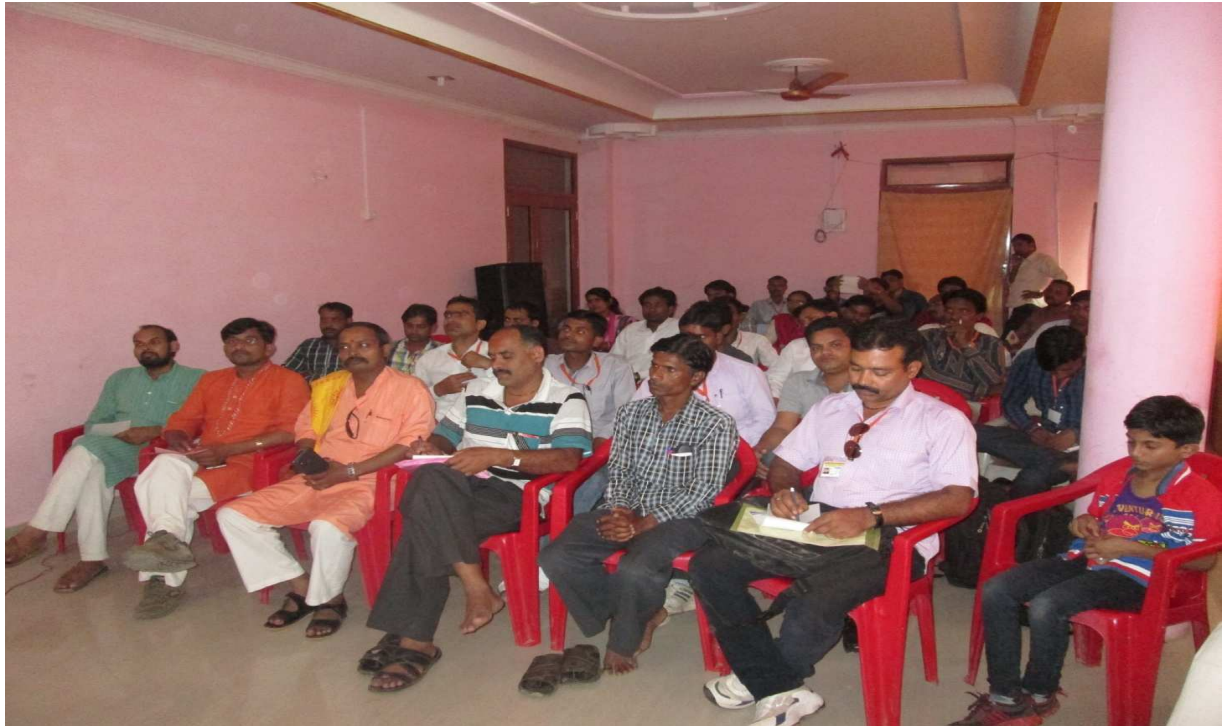
October 2, 2015 BSW Classes Started