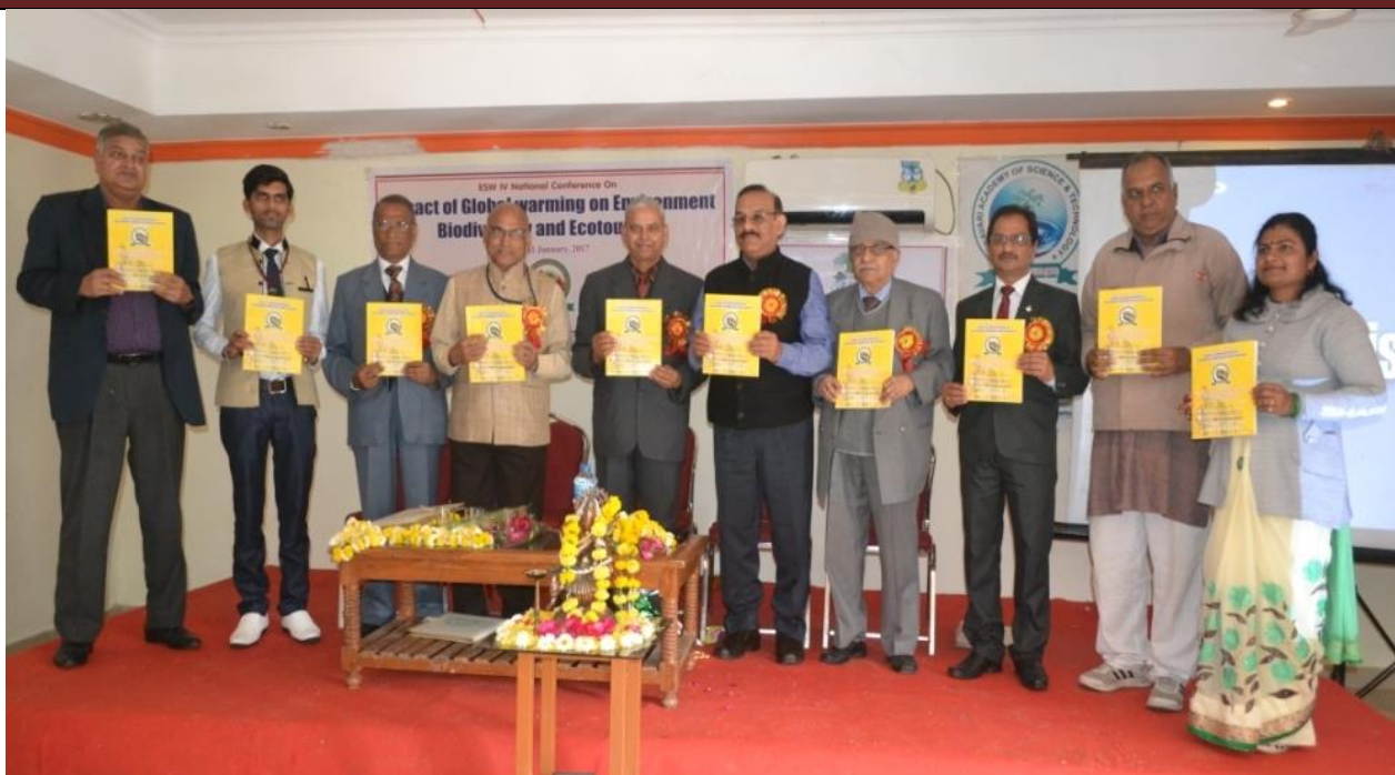
Released Souvenir by Guest

Regional Office: Godavaripuram, Ward No. 17, Chhatarpur-471001 Madhya Pradesh