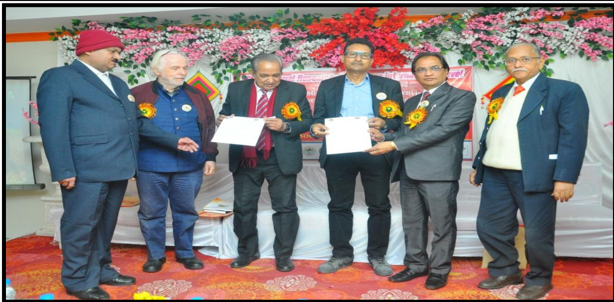
ESW Society, Khajuraho, India and Sikkim Skill University, Sikkim, India

Annual Report 01 May, 2022 to 30 April, 2023