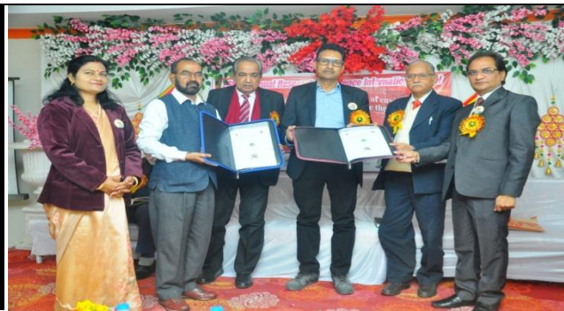
ESW Society, Khajuraho, India and ICAR-CAFRI Jhansi, Uttar Pradesh, India