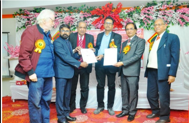
ESW Society, Khajuraho, India and LND College Motihari, Bihar, India