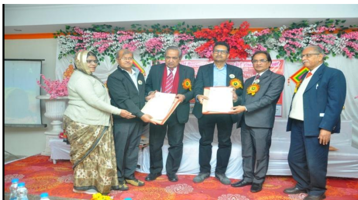
ESW Society, Khajuraho, India and Govt. Kalidas College, Ujjain, Madhya Pradesh, India